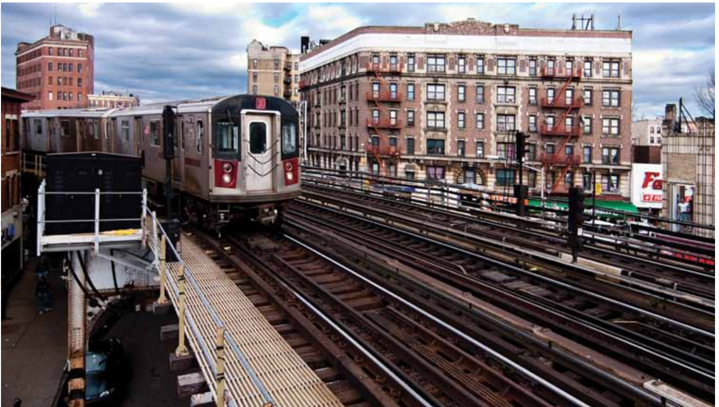
NYC Subway Train Riding Through Bronx, NY