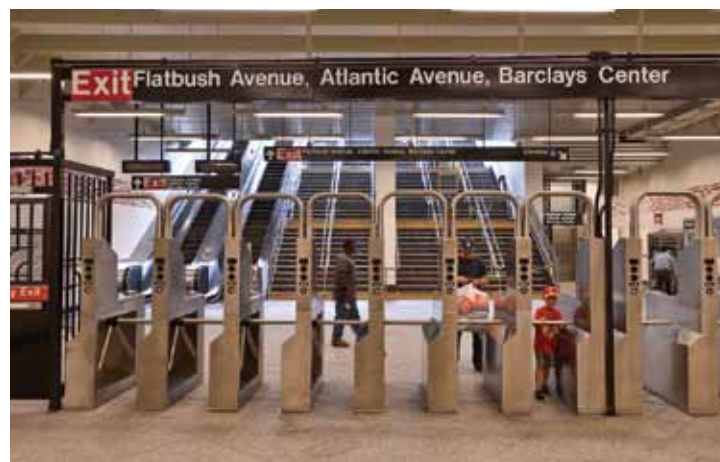
Atlantic Avenue – Barclays Center Station

Atlantic Yards is a 4.9 billion dollar mixed-use project planned for a 22-acre area around Atlantic Terminal, an intermodal transit hub in the vicinity of Downtown Brooklyn. Nine subway lines, the Long Island Rail Road, and a dozen bus lines serve the project area directly. One of the largest redevelopment projects ever constructed outside of Manhattan, the project is sponsored by Forest City Ratner Companies (FCRC) and managed by the Empire State Development Corporation (ESDC), a quasi-public state entity with redevelopment authority. FCRC's plan includes 16 high rise towers that will provide 6,430 of housing units (including 2,200 affordable units), a hotel, office and retail space,