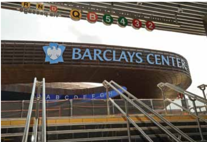
Barclays Center