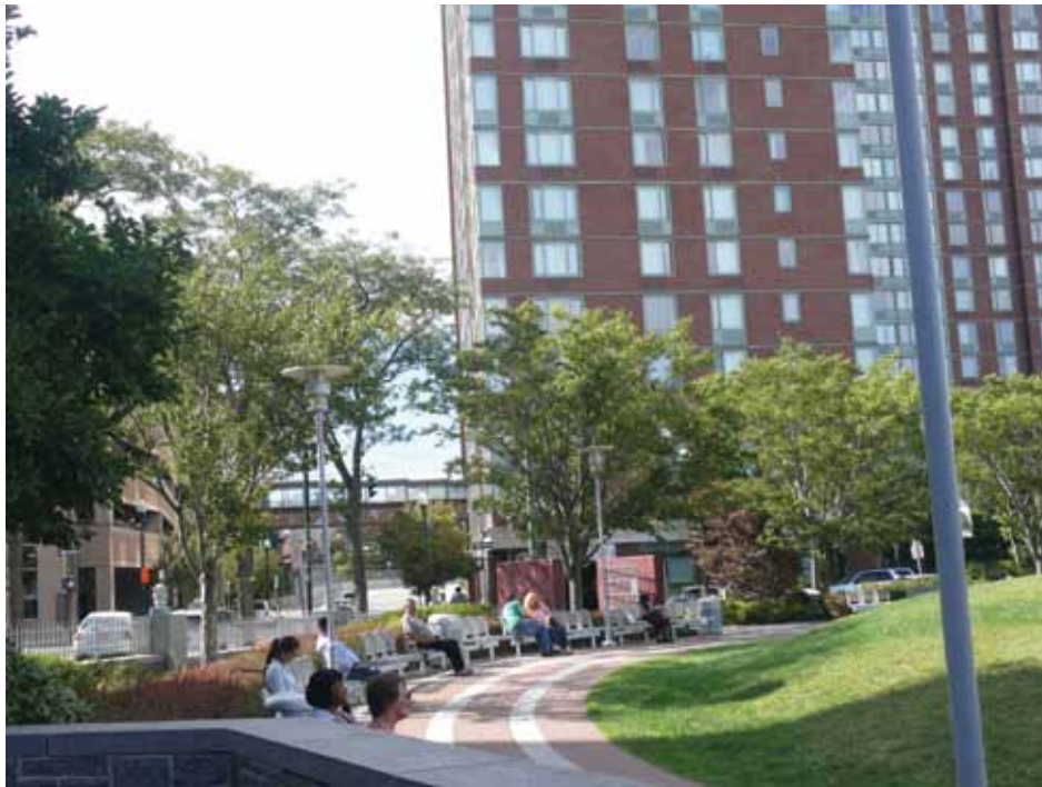
New Rochelle, NY

large lots than there is demand for them. Similarly, recent housing surveys suggest that housing preferences are tied closely to commute times. The 2011 NAR survey reveals 59 percent of Americans would choose a small house with a commute under 20 minutes over a large house with a commute over 40 minutes. Moreover, emerging housing value studies show that people are willing to pay more for walkable communities than auto-oriented communities. 10