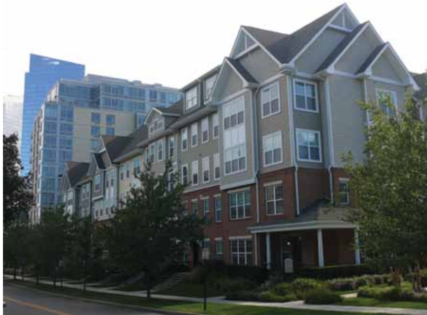
White Plains, NY

opments could house the next generation of the region's population and entrepreneurship, while meeting the needs of the new economy and the nation's changing demographics. For more information on the Consortium, please visit http://www.sustainablenyct.org/ .