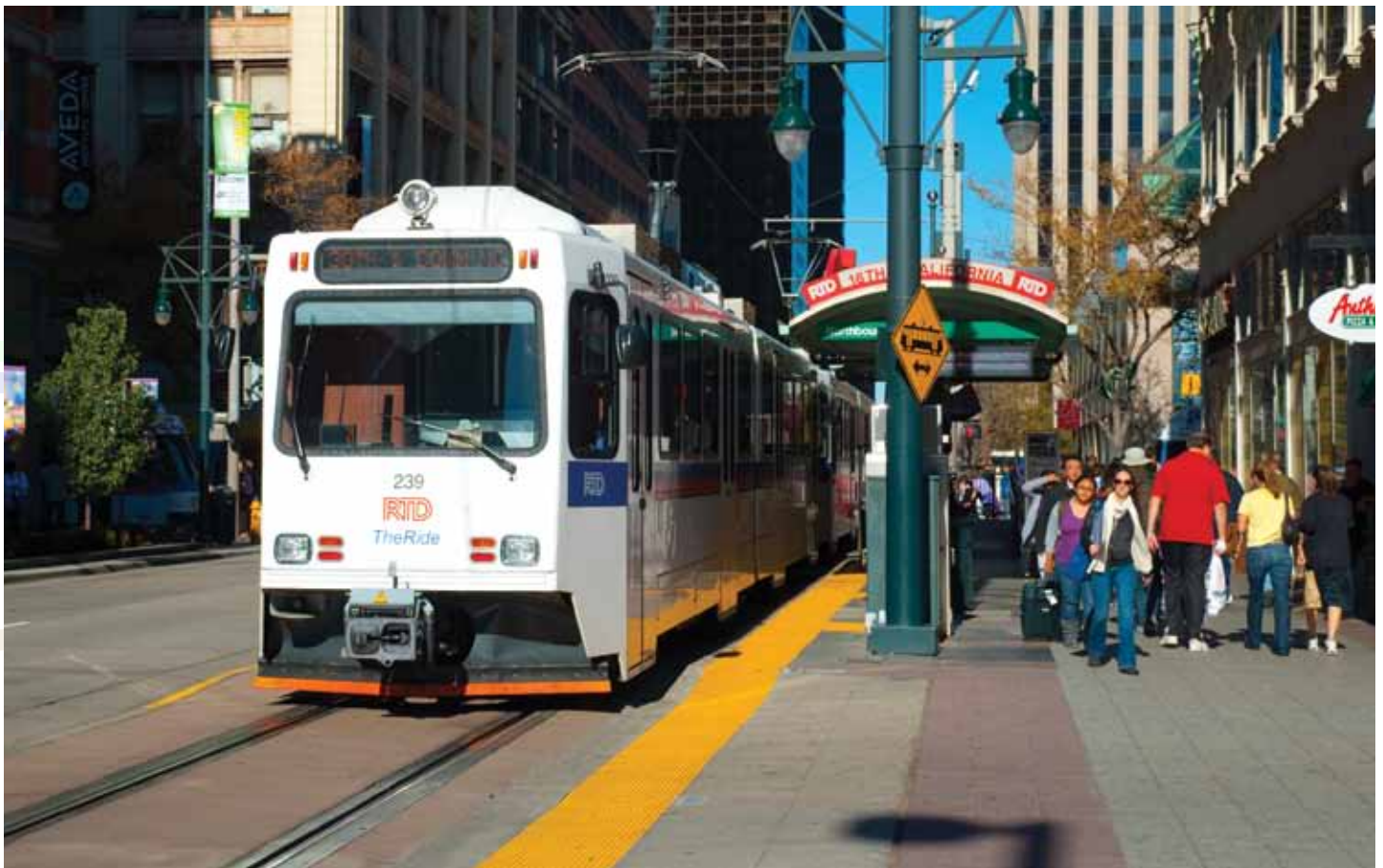
Riders getting off a RTD Light Rail train in Downtown Denver

Link: http://milehighconnects.org/equity-atlas.html .