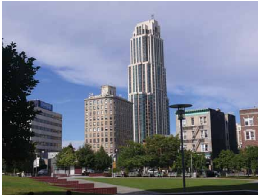
New Rochelle, NY

Despite the growing recognition that high-end rental apartments, condos, and modern office space have proven successful redevelopment ventures around certain of the region's rail stops, not every station area can support these uses. Nor are those three uses alone sufficient to create vibrant, livable communities in the vicinity of a station. If each community is left to plan its own station area in a vacuum, the